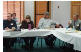
Sponsors and board members listening to presenters during our annual sponsors meeting.