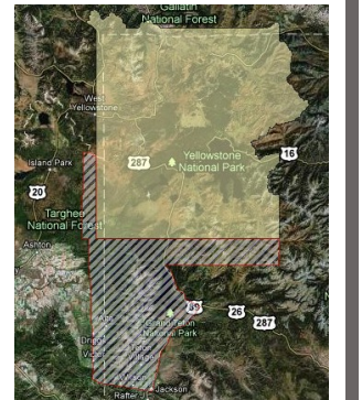
New buffer zone for Rapid Response.